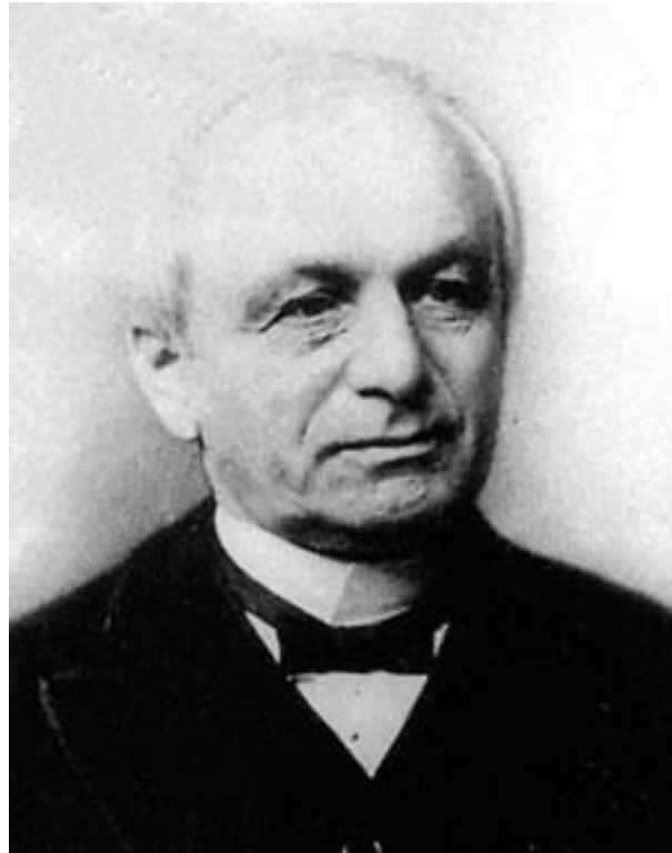
Leopold Kronecker (1823-1891)

God made the integers, all else is the work of man.