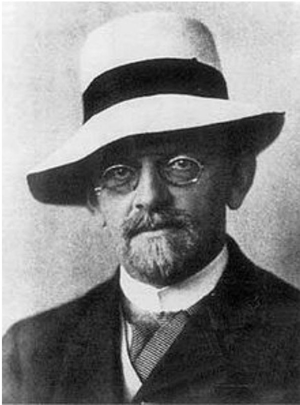
David Hilbert (1862-1943)

Cantor had influential admirers too, among them David Hilbert, who set the course of much of 20th Century mathematics in his address to the International Congress of Mathematicians in Paris in 1900.