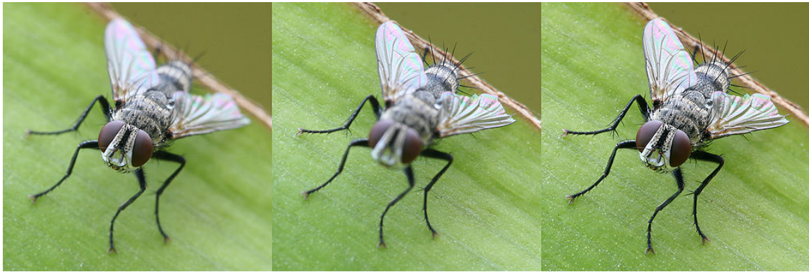
Figure 1: Focus bracket of a Tachinid fly. The rightmost image results from the composition of the two other images.

In the field of visual arts, photographers use many shallow-depth-of-field shots and stack them together to get an extended-focus image.