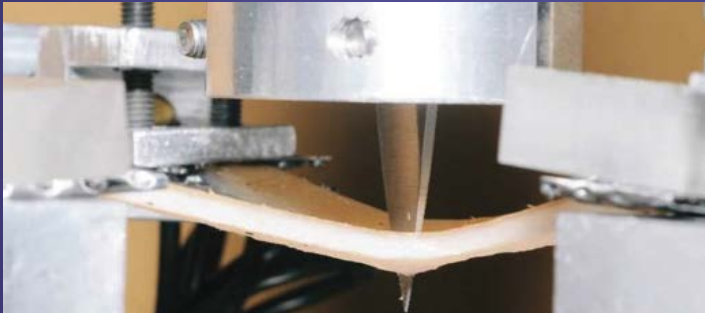
Knife puncturing porcine skin

In recent years, the fields of biomechanics and forensic medicine have merged to form a new discipline: forensic biomechanics. This discipline has met the needs of the legal system in particular, with engineers increasingly acting as expert witnesses in courts of law.